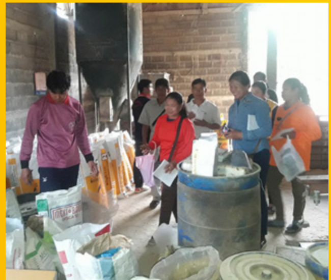
Dong Kha pig producers on their study tour to Thailand: taking notes on pig feed formulation during a field visit

Following the consultation meeting, the pig-raising group arranged their study tour to Thailand in January 2018 with backstopping from CDAIS. The group included two staff from Xanakham DAFO. During the first two days, the group learnt about farm management from a Rajabhat University expert, with a third day at Yong Yut Farm for hands-on experience and visiting a feed mill where they picked up tips on optimal feeding practices. "What we learnt is practical and can help us grow our business without making a lot of mistakes," said Dao, the group's marketing lead.