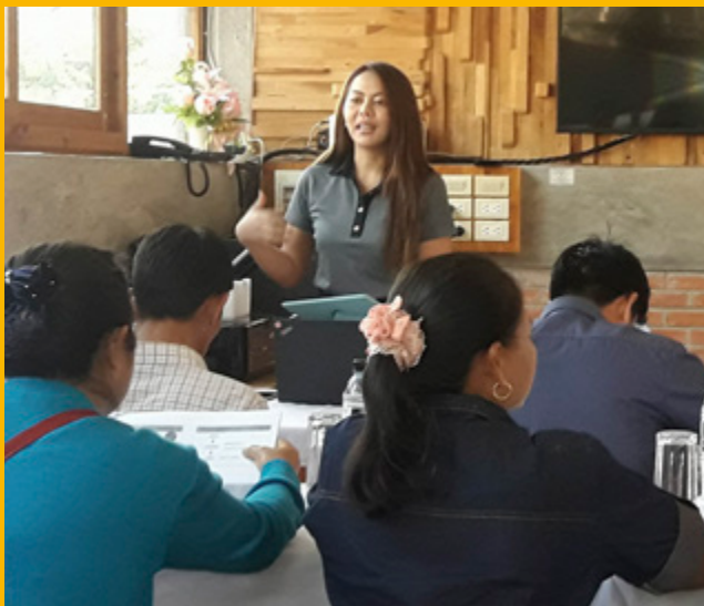
Dong Kha pig producers on their study tour to Thailand: learning about piglet production from Thai experts

An element of the CDAIS approach is building bridges between people. Connecting smallholders with government services means CDAIS projects will continue long after the funding ends. Based on the group's plan, CDAIS facilitated a training-and-study tour to NAFRI's pig research centre in Vientiane in November 2017. The group members then decided they wanted to visit a commercial operation in Thailand from where they have been buying piglets for some time, but it was difficult for them to make arrangements on their own. The District Agriculture and Forestry Office (DAFO) offered support and CDAIS helped contact Thai farms, with one producer accepting an invitation to a consultation meeting in July 2017 leading to a signed collaboration agreement between the Dong Kha pig group and Yong Yut Farm in Thailand. "Arranging the consultation meeting was an important breakthrough," said Patrick D'Aquino, CDAIS Focal Person for Laos. "As an external agency we have a certain amount of 'convening power' that allows us to create space for and facilitate dialogue. Once we get different stakeholders talking they usually find a way to meet everyone's needs."